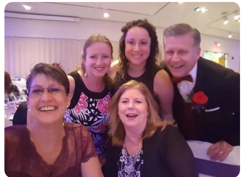
Cousin Trip... fun times in Louisville, KY