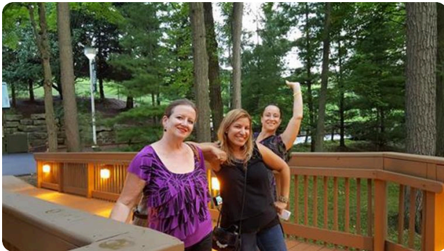
Hey Hey fun Cousin times!