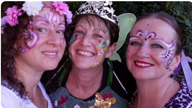
Ren Ce festival