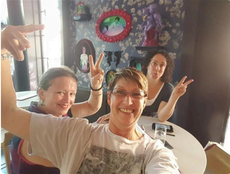
Cousin Trip... fun times in Louisville, KY