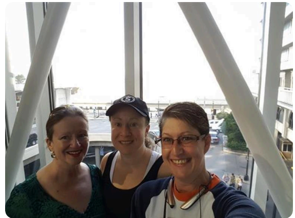
Cousin Trip... fun times in Louisville, KY