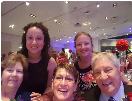
Cousin Trip... fun times in Louisville, KY